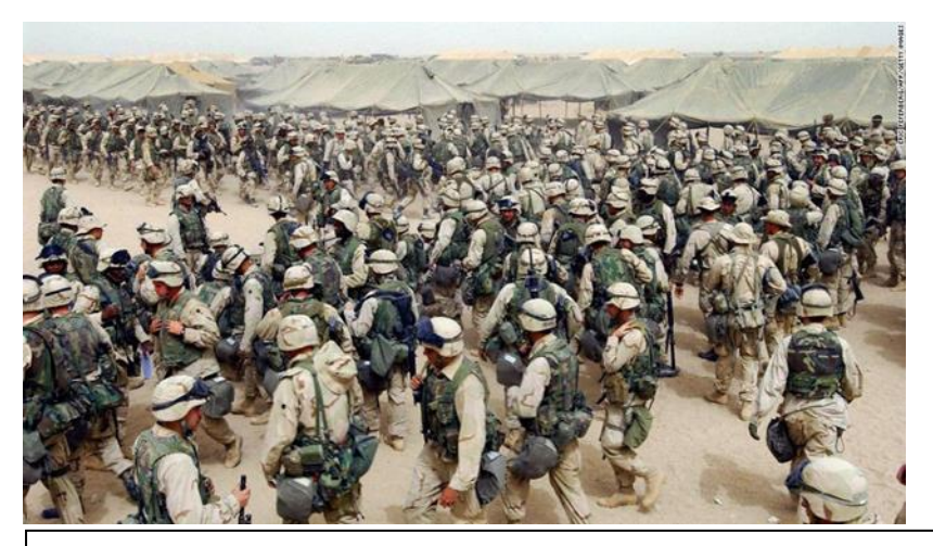
Picture 3: U.S. Marines in the Northern part of Kuwait after receiving the orders to cross the Iraqi borders